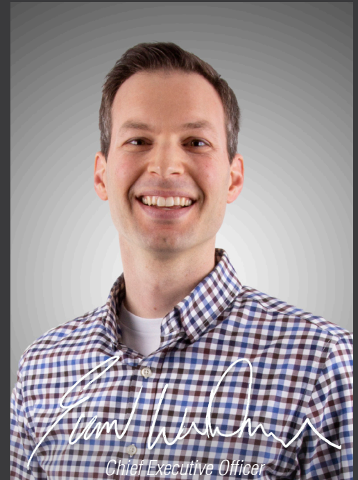
Chief Executive Officer

Momeni Engineering Ergonomic Collective Grip VP of Supply Chain In Memoriam Noteworthy Trade Shows