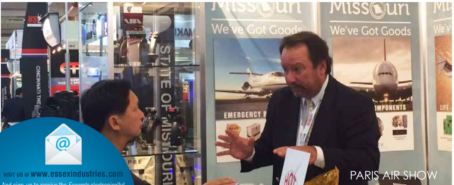
PARIS AIR SHOW