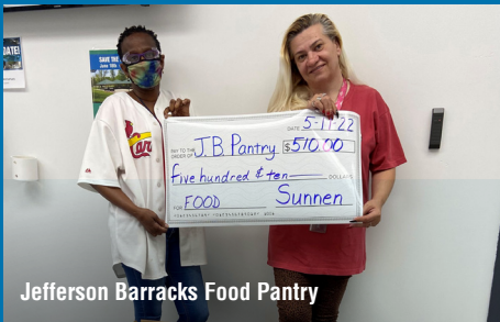
Jefferson Barracks Food Pantry